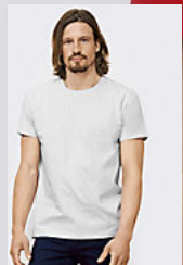
SOL'S IMPERIAL 11500