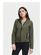
SOL'S RACE WOMEN 01194