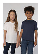
SOL'S REGENT KIDS 11970